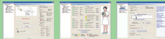
FULL STATUS MONITOR