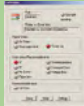
STATUS MONITOR for remote printer status monitoring