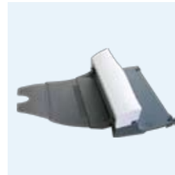
FB-70M MICR BASE